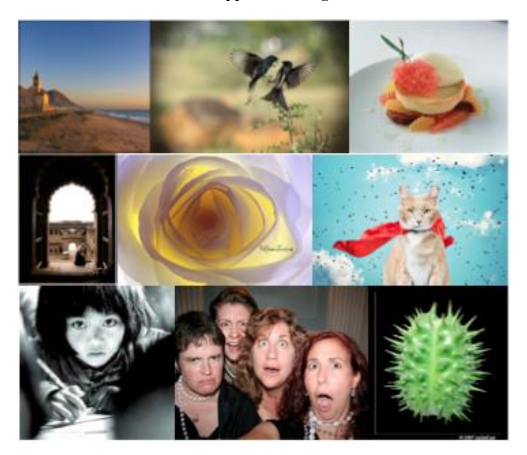
Fig. 1. Image examples in the database. Images in the database were crawled from Flickr.com, with 558 emotional words as crawling seeds