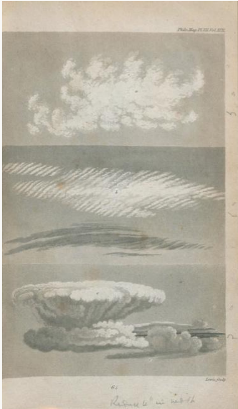
Fig. 3, [?] Lewis, Illustration for Luke Howard, “On the Modifications of Clouds, and on the Principles of Their Production, Suspension, and Destruction, Being the Substance of an Essay Read before the Askesian Society in the Session 1802–3,” from The Philosophical Magazine , October 1803, n.p. Aquatint. [return to text]