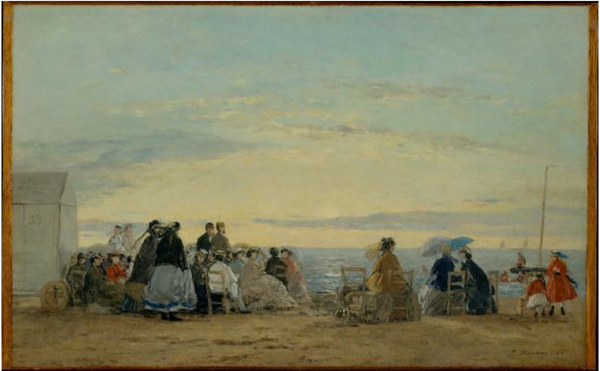
Fig. 5, Eugène Boudin, On the Beach, Sunset , 1865. Oil on wood. The Metropolitan Museum of Art, New York. [return to text]