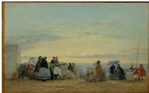
Fig. 5, Eugène Boudin, On the Beach, Sunset , 1865. Oil on wood. The Metropolitan Museum of Art, New York. [larger image]

What have these experiments with computer vision contributed to my practice as an art historian? For one thing, I have become more attentive to my own habits of looking, with a sharpened awareness that my perception is inflected by both disciplinary and personal biases. I am trying to be more alert to what is just outside my perceptual field—to look past the Adorations, so to speak, to see what else may be in plain view without being apparent. I also have a renewed appreciation of the cognitive as well as historical distance separating me from the subjects I study. Of course, narrowing that distance is arguably the aim of art history, and my own attraction to computer vision is found in its potential to help me see a little more historically. Do I believe computer vision has the potential to serve as a kind of prosthetic “period