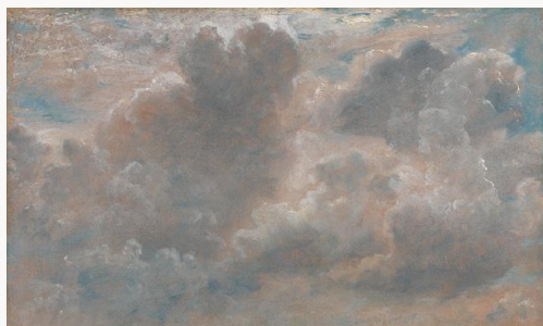
Fig. 1, John Constable, Cloud Study , 1822. Oil on paper laid on canvas. Yale Center for British Art, Paul Mellon Collection, New Haven. [larger image]

nature.[4] If each of Constable's cloud studies really was unique—and produced by an imagination so empirically fluent that they appeared to be directly copied from nature—then my hypothesis might stand. But then I started to have doubts. Am I just so accustomed to perceiving clouds painted the way Constable paints them as realistic that I am naively trusting their accuracy? Alternatively, was Constable relying on a discrete set of patterns or formal structures that successfully captured the appearance of a cloud and then simply repeating them in slightly different arrangements to give the effect of particular clouds when he was really painting essentially the same few clouds again and again? Confronted with these doubts, I wondered how to assess the degree to which Constable's striking effects of naturalism might be due either to pictorial conventions that had become naturalized or to formal repetitions indiscernible to most observers. Computer vision struck me as uniquely suited to the task.