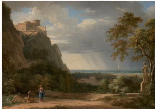
Fig. 4, Pierre Henri de Valenciennes, Classical Landscape with Figures and Sculpture , 1788. Oil on panel. J. Paul Getty Museum, Los Angeles. [larger image]

features can be further used to measure formal similarity between paintings and photos.[35] Valenciennes's clouds were scored by the CNN as the most similar to photographic clouds (fig. 4). Constable ranked quite closely behind Valenciennes, with Constable's emulators Lionel Constable, Watts, and Lee trailing them slightly.[36] Historians of nineteenth-century art will perhaps not be surprised to learn that the computer deemed Eugène Boudin's clouds comparatively "unrealistic" (that is to say, unphotographic) and, in the first experiment, accorded lower probability to Boudin's clouds' classification as a specific type of cloud. Painting later in the century, Boudin is famous today as the teacher of impressionist Claude Monet, and Boudin's looser technique can hardly be described as photographic (fig. 5). Even so, his contemporaries saw great truth in his views, and he was known in his lifetime as the "king of skies."