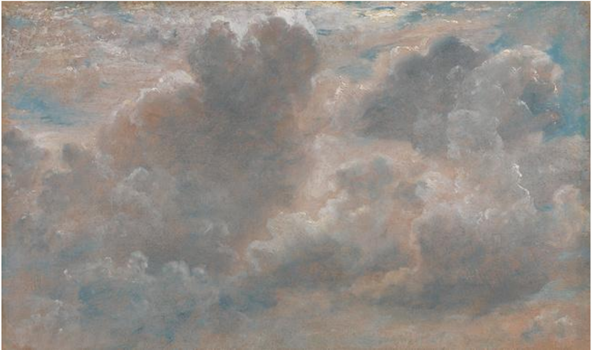
Fig. 1, John Constable, Cloud Study , 1822. Oil on paper laid on canvas. Yale Center for British Art, Paul Mellon Collection, New Haven. [return to text]