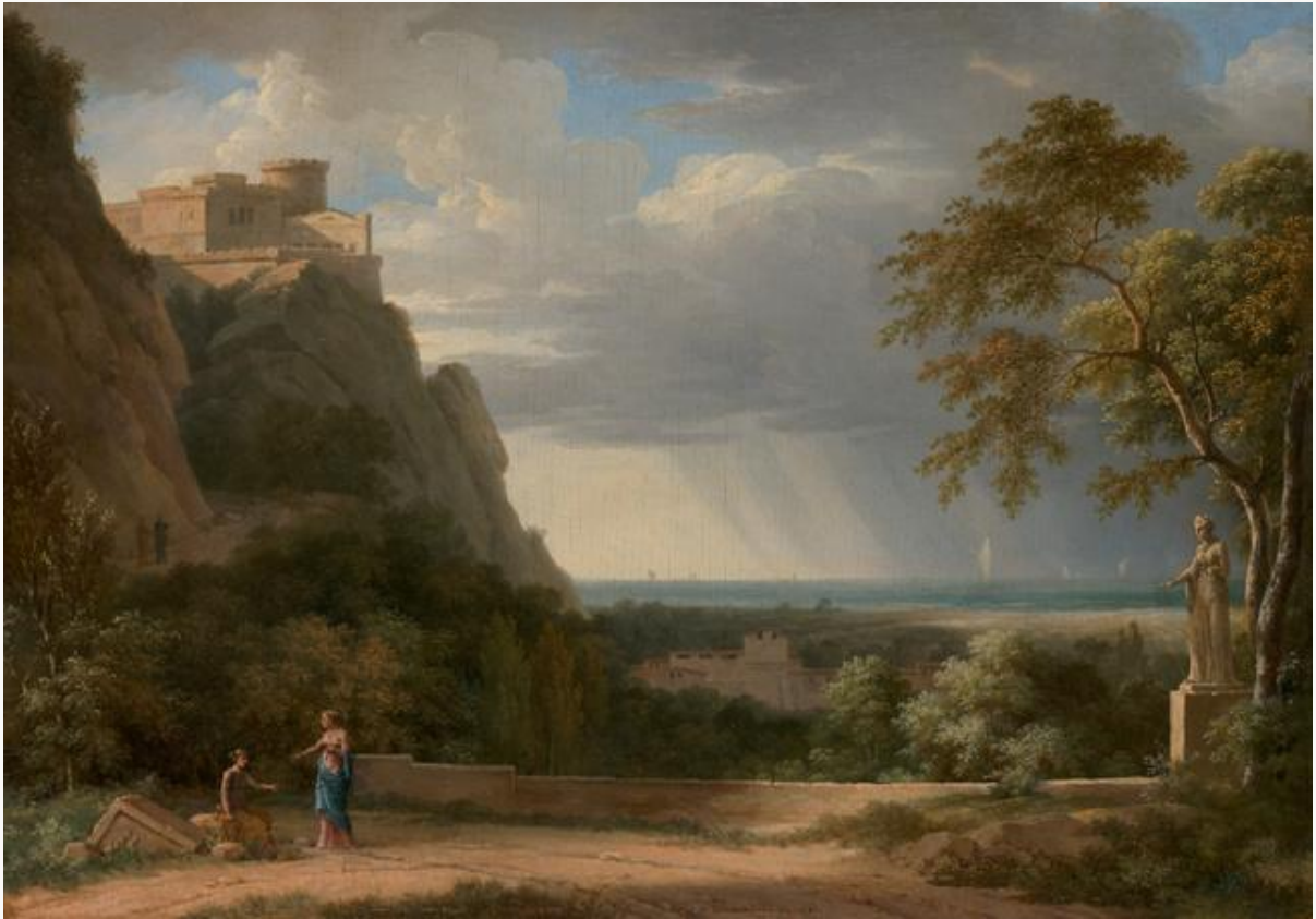
Fig. 4, Pierre Henri de Valenciennes, Classical Landscape with Figures and Sculpture , 1788. Oil on panel. J. Paul Getty Museum, Los Angeles. [return to text]