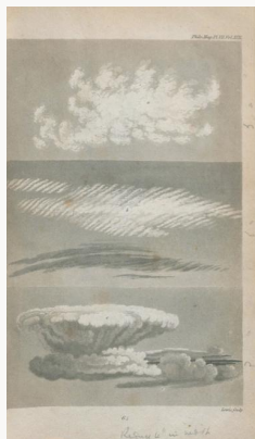
Fig. 3, [?] Lewis, Illustration for Luke Howard, “On the Modifications of Clouds, and on the Principles of Their Production, Suspension, and Destruction, Being the Substance of an Essay Read before the Askesian Society in the Session 1802–3,” from The Philosophical Magazine , October 1803, n.p. Aquatint. [larger image]